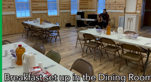
Breakfast set up in the Dining Room