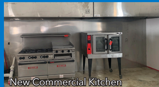
New Commercial Kitchen