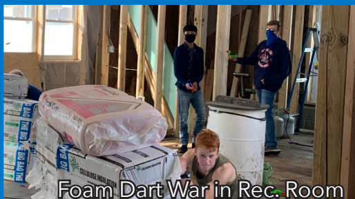
Foam Dart War in Rec. Room